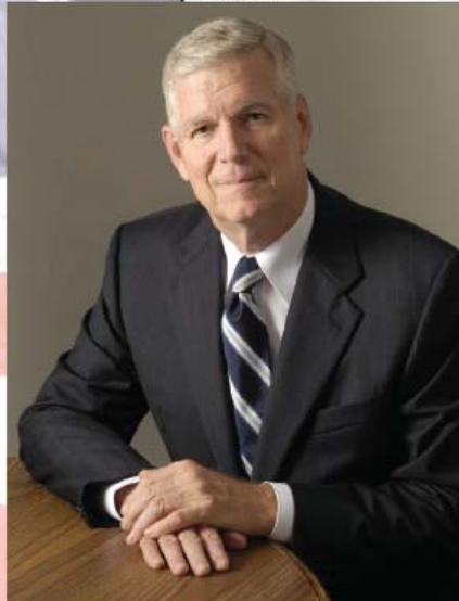
General Richard B. Myers, U.S. Air Force (Ret.) Former Chairman, Joint Chiefs of Staff

Wichita Airport Hilton Hotel March 6, 2010 Speaker