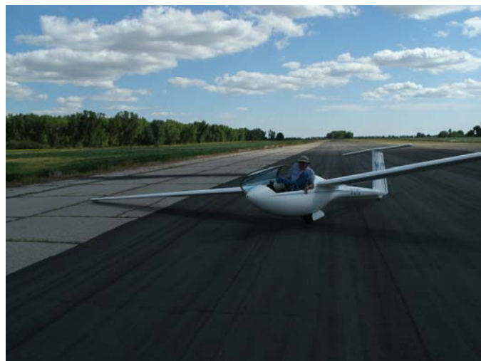
Gary Hurst bringing his Pik-20 back to Sunflower.

The lift was reported as fantastic. Not the strongest they had seen, but lots of it. Reports came back of having flown for miles at 80-90 MPH in glass ships without losing any altitude! New pilots were venturing out cross country. Students were thermalling and logging their longest flights. It did turn out to be a day not to be missed!