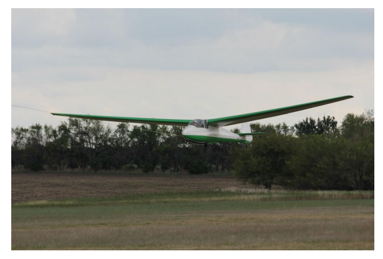
Neal Pfeiffer's Ka-2b

Here are a few pictures from the Vintage Rally. Look for a full report in the next Variometer .