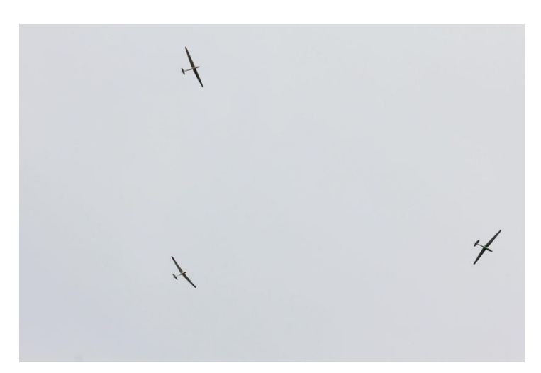
Gaggle over the airport