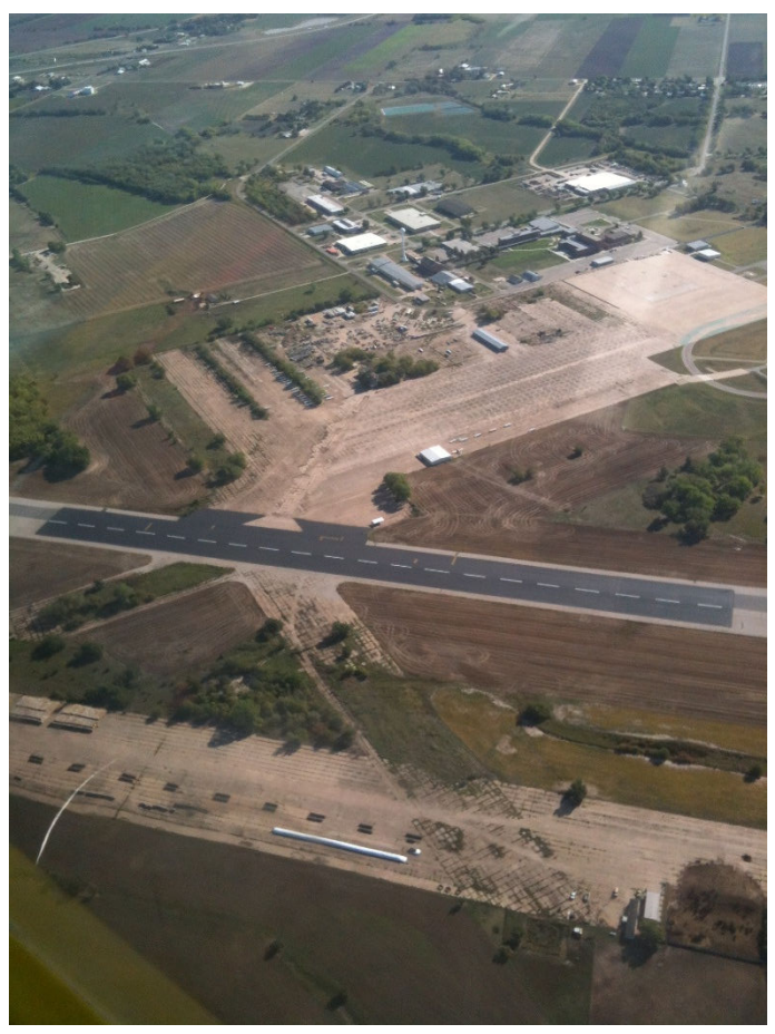
New blacktop from the back seat of the 2-33

The sealant that was applied should hold up pretty well. Wear and tear will shorten its life. So, please do not drive any vehicles onto the blacktop. If you are coming in from the north, there's a 25' unsealed section that leads to the north edge of the intersection. Please cross the black top at the north edge, and onto the concrete, before proceeding south to the sunshade. And if gliders are landed short, please keep the vehicles that retrieve them off the black top, again using the 25' unsealed surface on either edge of the runway. Thanks for your cooperation.