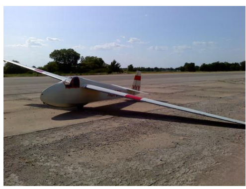
YYY back home after a great flight

I got to Haviland without too much trouble and it was familiar skies back to Sunflower. I was making great time and there were still lots of clouds along the way, not totally blue like last weekend. I got to the Pratt air-