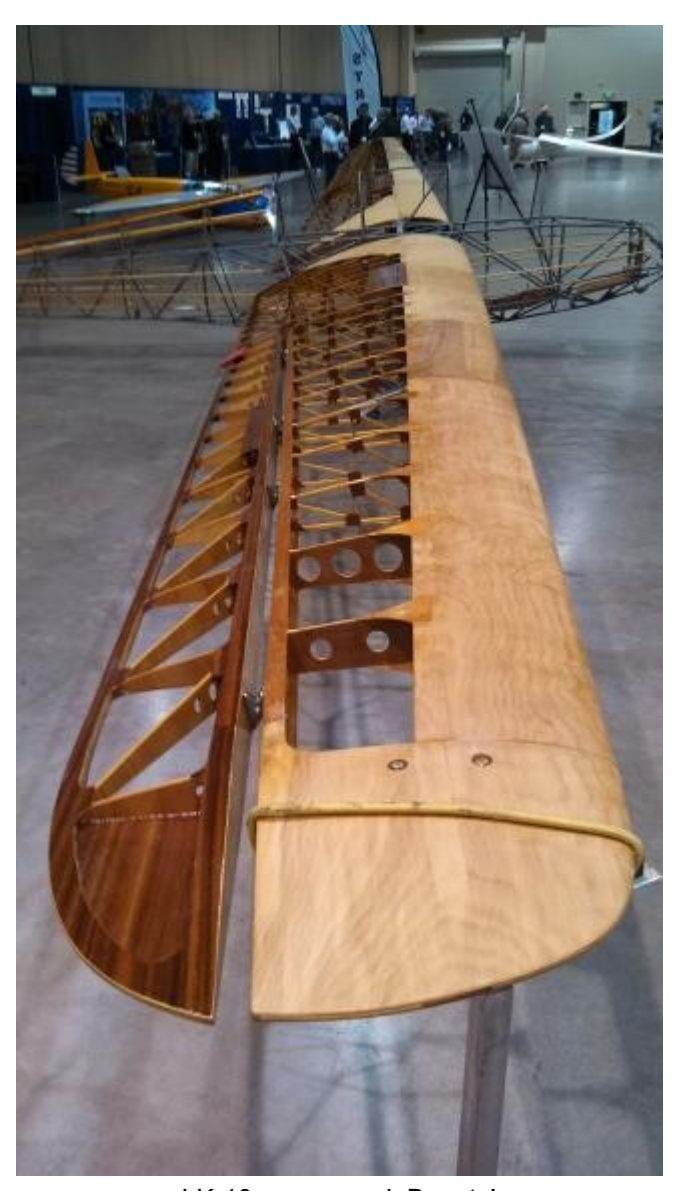
LK-10, uncovered. Beauty!