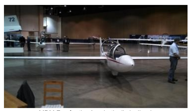
MDM Fox for the Aerobatically inclined