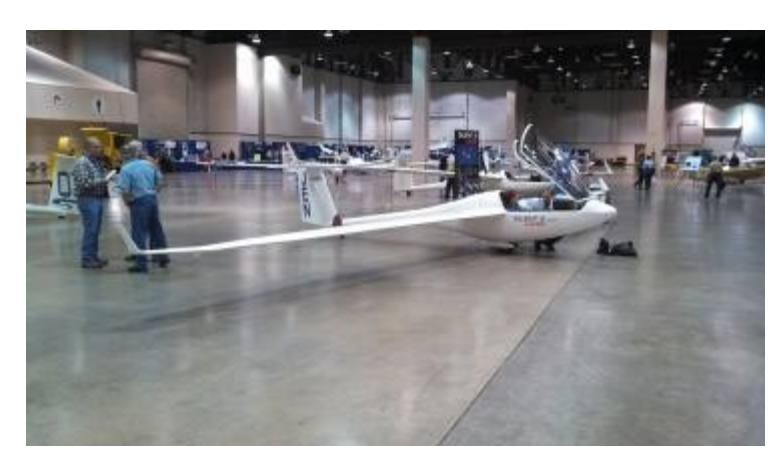
Silent 2 Electro