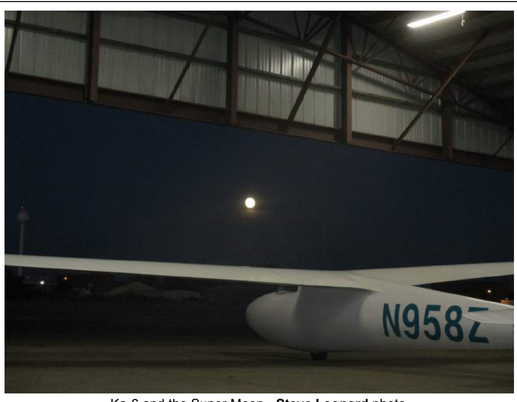
Ka-6 and the Super Moon