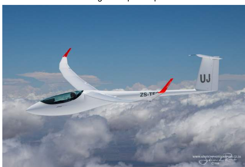
New JS-3 Rapture 15 meter racer from Jonker Sailplanes. Will be competing this month at the WGC in Benalla, Australia

Nov 26<sup>th</sup> - Dec 8<sup>th</sup> - 2<sup>nd</sup> FAI Pan-American Gliding Championships - Santa Rosa de Conlara, Argentina