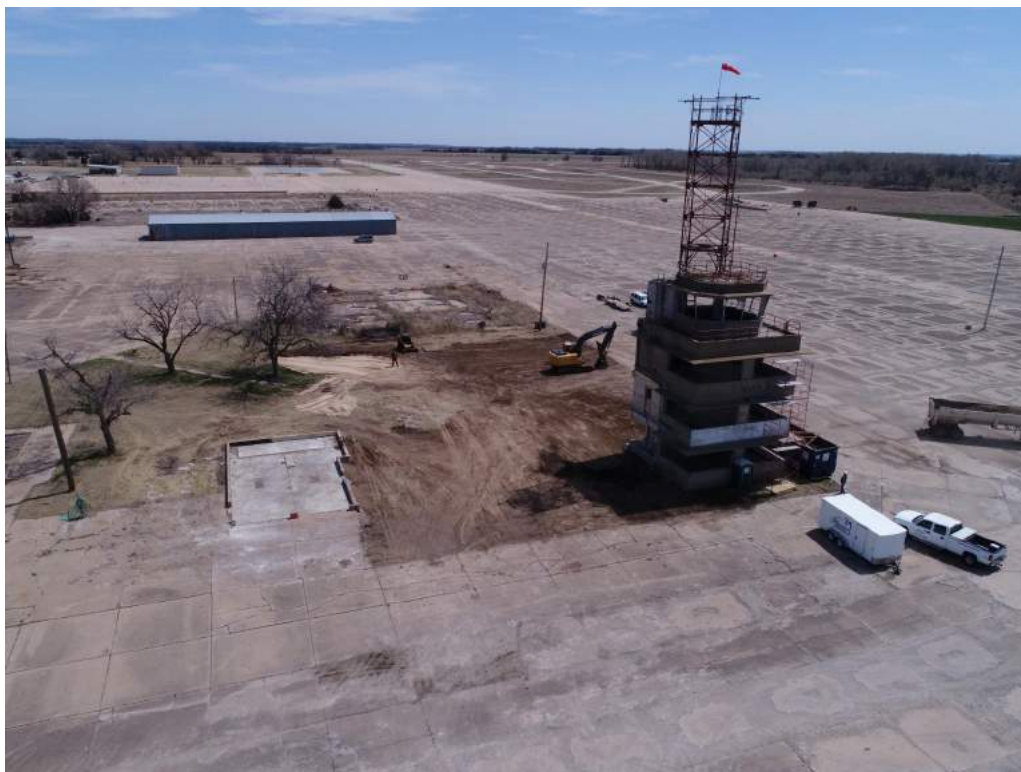
Tower Wings are no more!